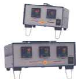
Temperature Control Consoles